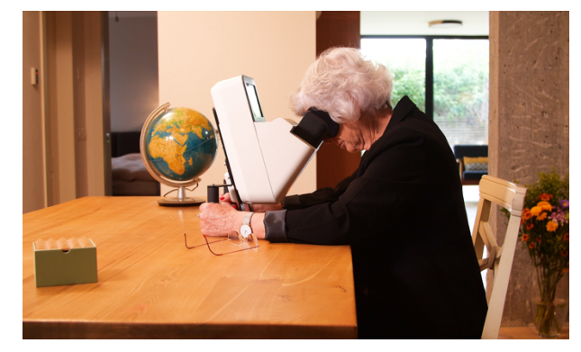
Figure 1. Patient self-operating Home OCT

A prospective and longitudinal study to understand patients' ability to self-image in a home setting with no prior training was conducted by prominent retina specialists Jeffrey Heier, MD and Nancy Holekamp, MD.<sup>2</sup> The program enrolled 15 wet AMD patients and the device was shipped to their homes by the Notal Vision Monitoring Center. Subjects were able to set up the device themselves and perform daily scans with the support of the Monitoring Center clinical staff. Patients demonstrated extraordinary self-imaging capability, with a total of 2,300 scans taken at a 95% success rate. Yingna Lui, MD recently presented the results from this